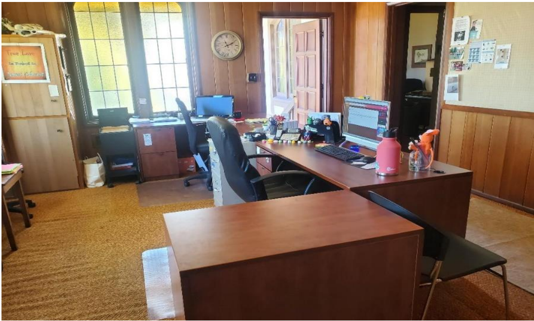
The new office layout